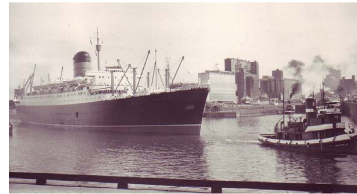
The "Carinthia" arriving in Montreal in July 1958