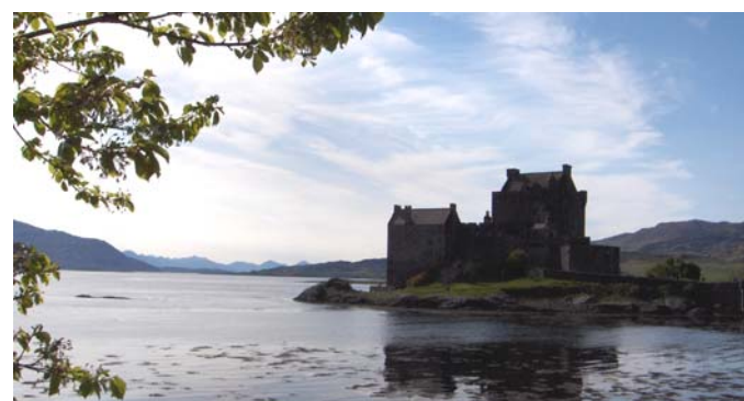
Eilean Donan Castle

For more information about the Clan and the Centre go to: www.clanmacmillan.org